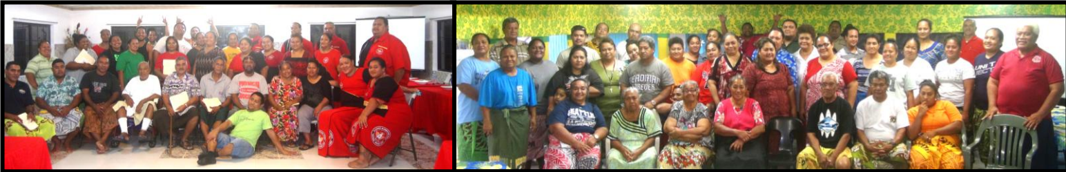
Masefau Elementary School Outreach Program 2015. Proud parents of Masausi, Sailele and Masefau.